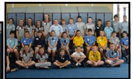
Yr 7 2013 ORIENTATION DAY BPC